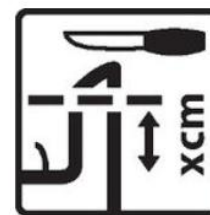
Trim Edge if Higher Than X cm