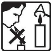
Snuff Out the Flame, Do Not Blow It Out