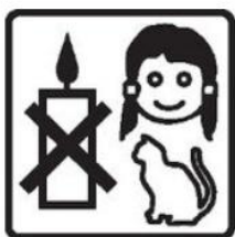
Keep Away From Children and Pets