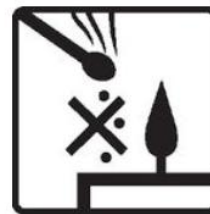
Keep Wax Pool Clear of Matches and Debris