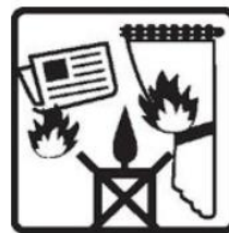
Keep Away From Things That Can Catch Fire