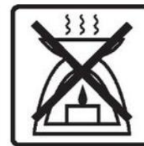
Do Not Burn in a Warming Unit