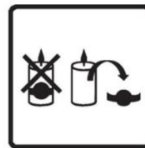
Remove Packaging Before Use