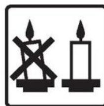
Place Candle Upright