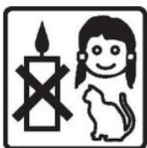
Keep Away From Children and Pets