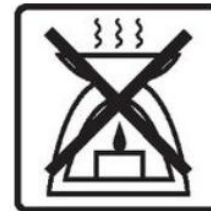
Do Not Burn in a Warming Unit