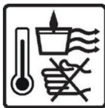
Do Not Touch, May Be Hot