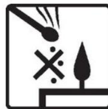
Keep Wax Pool Clear of Matches and Debris