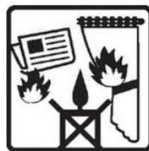
Keep Away From Things That Can Catch Fire