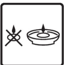
Use in a Suitable Bowl Filled with Water