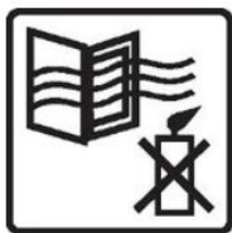
Do Not Burn in a Draught

Contains: 3-Octanol, 3,7-dimethyl-, Octabenzene. May produce an allergic reaction.