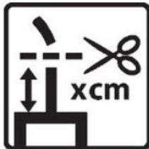
Trim Wick to X cm