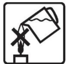
Never Use Liquid to Extinguish