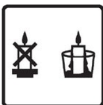
This Candle Liquifies, Use a Suitable Container