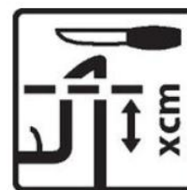
Trim Edge if Higher Than X cm