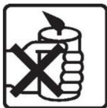
Do Not Move a Burning Candle