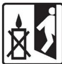
Never Leave a Burning Candle Unattended