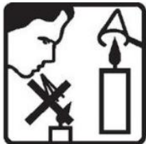
Snuff Out the Flame, Do Not Blow It Out